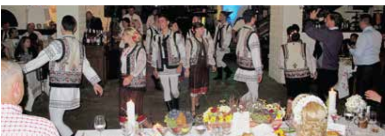
20:00 Romanian New Year's Eve 2016 at Hanu Ancutei