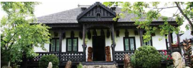
Nicolae Popa Museum