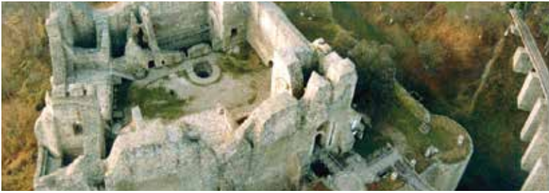
The medieval fortress ( Neamt Citadel ):

09:30 Trip in touristic area from Neamt County