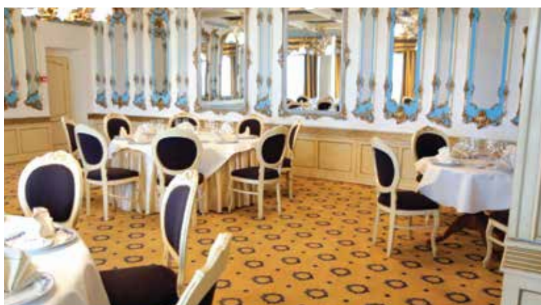
19:00-23:00 – Dinner at Blue Room - baroque