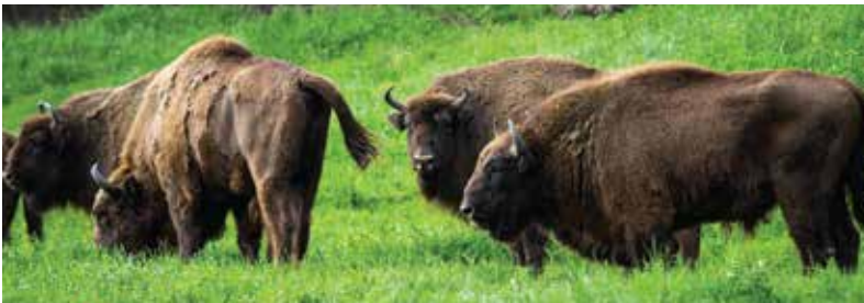
The Aurochs Reservations